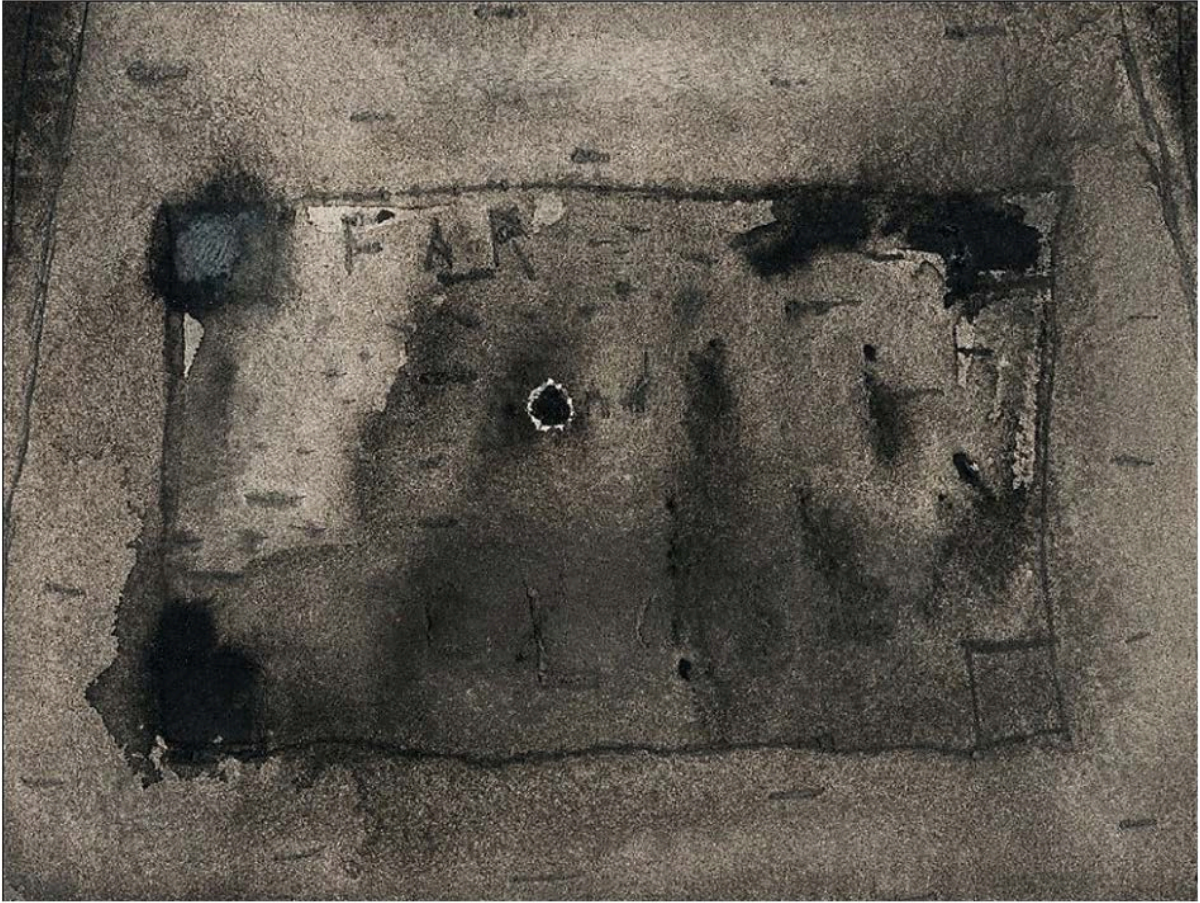
Image © David Lynch, Far Close, undated

The words scrawled into the surfaces are the central theme of the exhibition: 'naming'. It attempts to explore the relationship between words and things: a relationship which is never as simple as it seems.