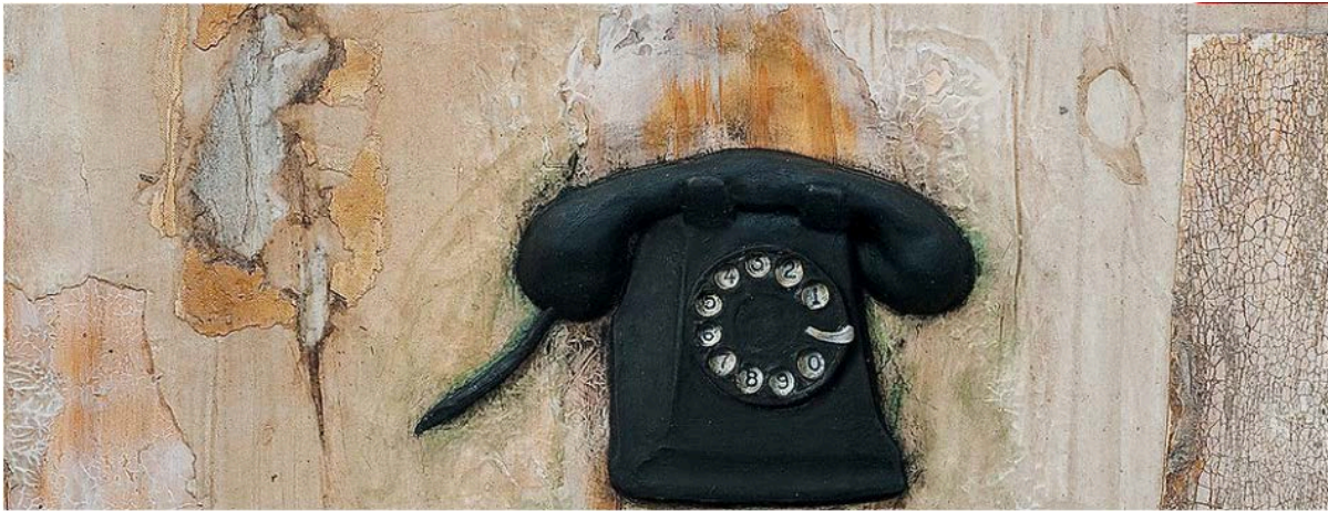
Telephone (detail), undated